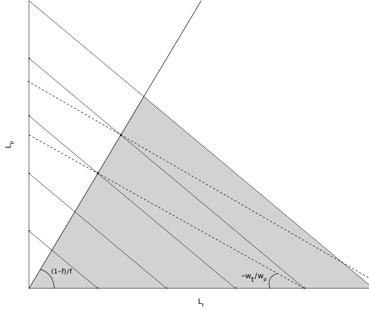
Figure 3: Cost minimization

firms use exclusively permanent contracts as in Shapiro-Stiglitz. Differently, the intersection points between each isoquant and the horizontal axis relates to the opposite case in which firms use only temporary workers. We stress the fact that since employees are equally productive under both types of contract and permanent workers are paid more than temporary ones, the higher the value of f , the lower the cost of labor. Moreover, the production expansion path, defined as the ratio between the optimal number of permanent and temporary workers for each level of production, is represented in figure 3 as the increasing line with a slope negatively related to f . Even though firms would always prefer to offer a temporary contract rather than a permanent one, they must also guarantee the equilibrium conversion rate in order to elicit effort 16 . As a result, the incentive structure can be sustained as an equilibrium outcome only if permanent workers do not disappear and temporary workers enjoy a credible expectation to be promoted into a permanent position. Then, each firm will convert half of temporary workers into permanent positions (i.e. c_p^* = \frac{1}{2} ). Therefore, there exists an equilibrium value of f for which, in steady state, firms maintain the minimum number of